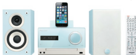
X-CM42BT-L (Light Blue)