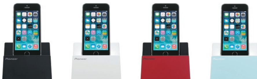
iPod/iPhone/iPad stand (same colour as the main unit) included